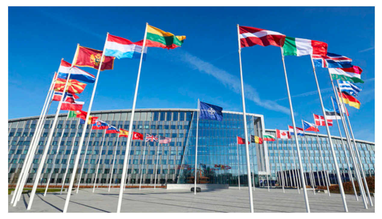
NATO HQ, Brussels

From 26-28 August 2022, Staff Interpreter Representatives from international, regional and national organisations around the world will come together for the annual CdP meeting.